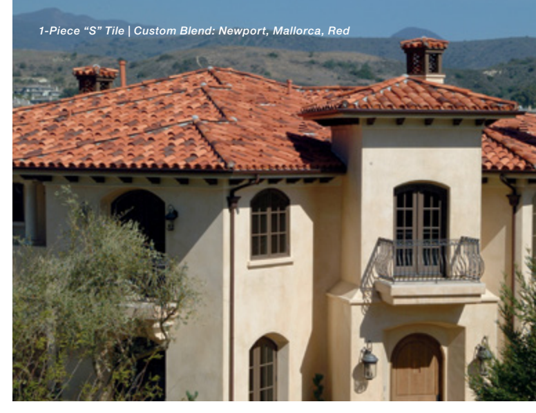
Ref: .42 / Emit: .84 / SRI: 45 / Aged SRI: 42