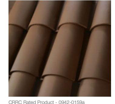
Ref: .30 / Emit: .85 / SRI: 30 / Aged SRI: 29

t: 1UADU3114 / p: 1UBDU6078 $\infty 59\%