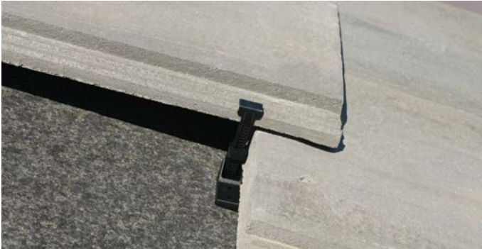
Medium clip on the low profile Newpoint™ Concrete Tile