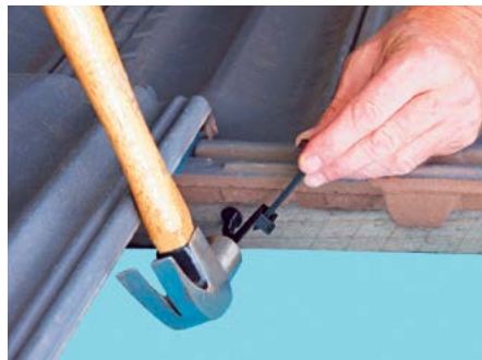
Hammer nail into batten