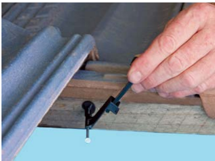
Position clip at 10° angle away from tile edge

Fasten into the batten of the lower course using the pre-installed nail to hold the field tiles when installed on Elevated Batten System® or counter batten system.