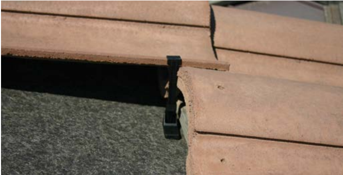
Tall clip on the high profile Newpoint™ Concrete Tile

Fasten to the roof deck with nails or screws to secure eave tiles and field tiles.