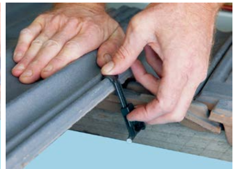
Swivel clip into position over tile and press firmly down to water course of tile